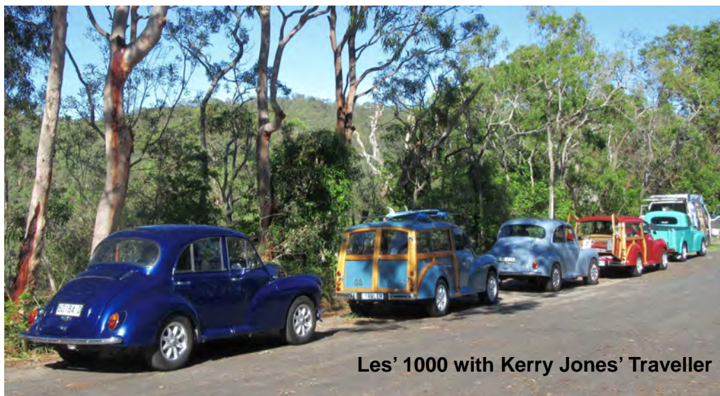
Les' 1000 with Kerry Jones' Traveller