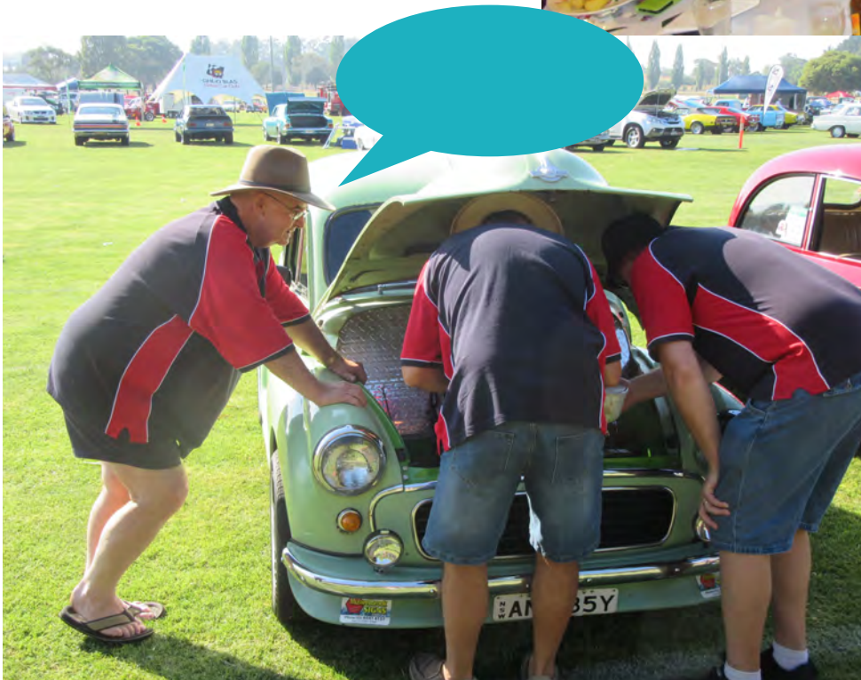
Caption competition, anyone?