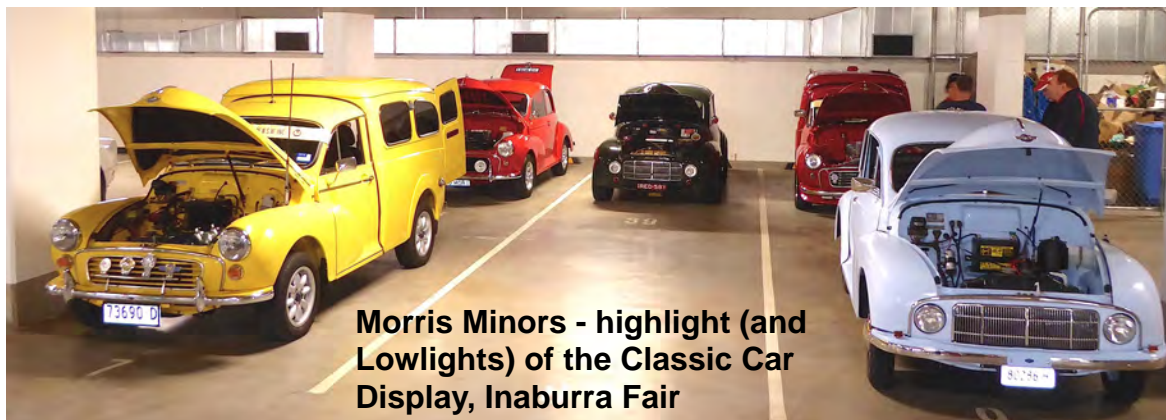
Morris Minors - highlight (and Lowlights) of the Classic Car Display, Inaburra Fair

What's the best thing about our club? While you ponder the question, let me throw in a couple of possible answers... Our Morris Minors? Certainly! The social activities? Definitely! The great club spirit? Absolutely! Supporting fund raising activities? Huh?