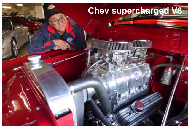
Chev supercharged V8

Hot coffee was the order of the day early on (essential). When we sat around at lunch, the conversation soon turned to "What engine would you put in your Morrie if you could?" So we wandered around checking the possibilities... Lotus