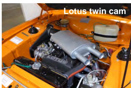
Lotus twin cam