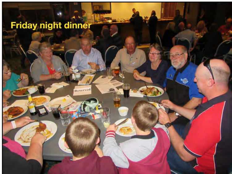
Friday night dinner