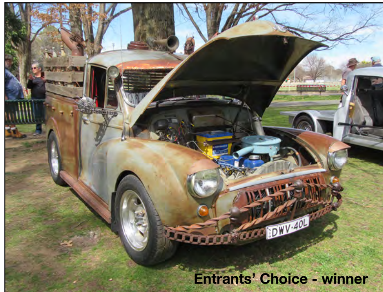
Entrants' Choice - winner

I left about 2:30 and arrived home about 5:30, completely exhausted but very happy. It had been a most excellent day! The Canberra Club can be well satisfied with their efforts. Very well done!