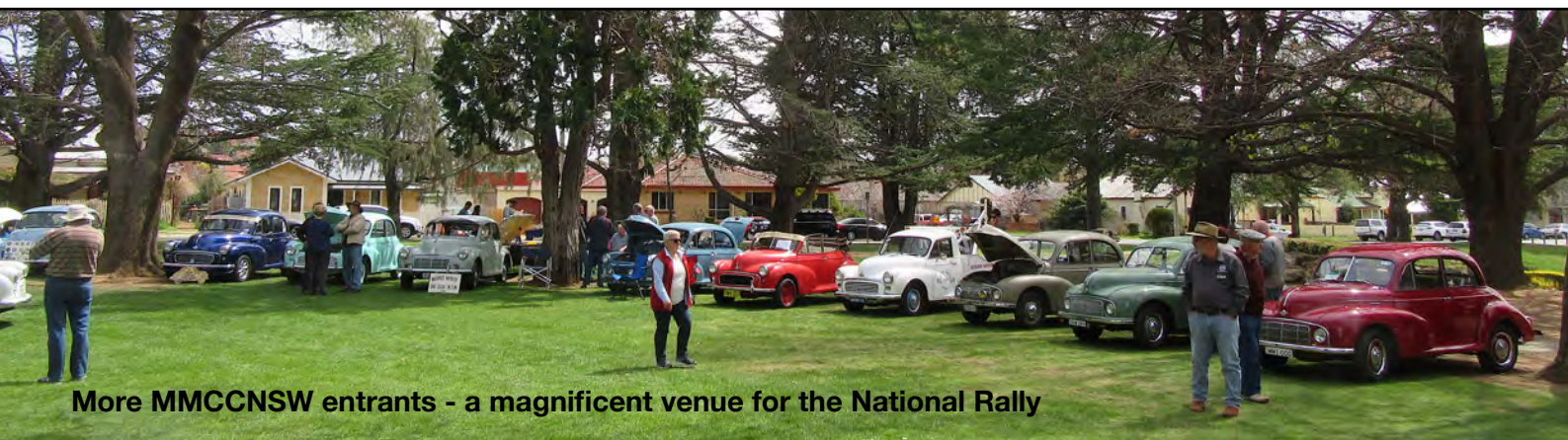
More MMCCNSW entrants - a magnificent venue for the National Rally