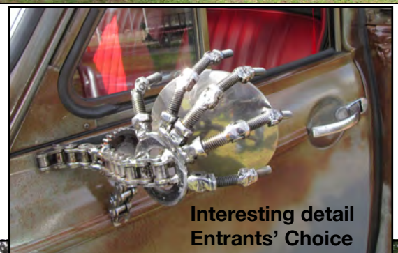
Interesting detail Entrants' Choice