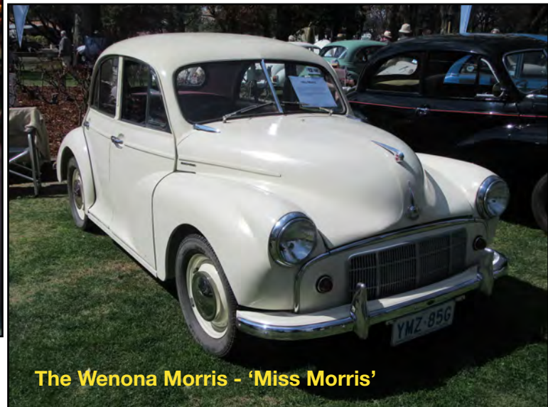
The Wenona Morris - 'Miss Morris'

The Wenona-restored Morrie was displayed at the rally with a sign paying tribute to the girls for their restoration. It is now owned by a new member of the Canberra Club, who engaged me in lengthy conversation on both the Friday afternoon and again on Saturday about the car and its restoration process.