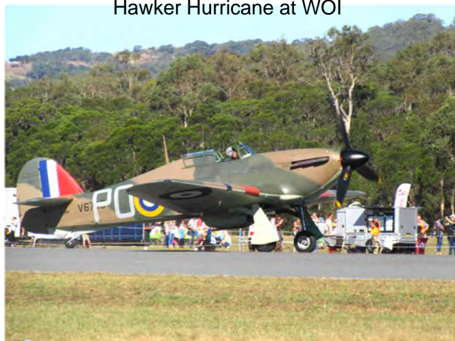
Hawker Hurricane at WOI