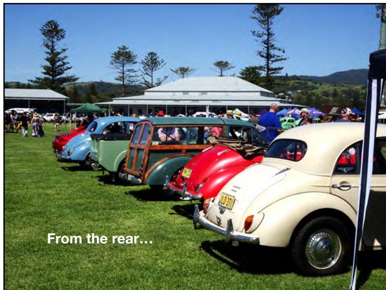
From the rear...