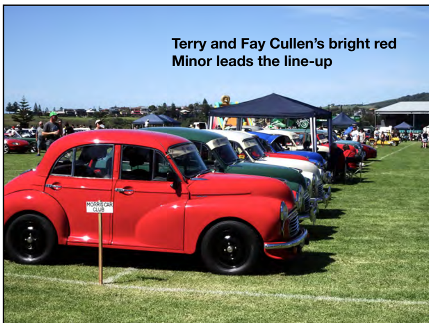
Terry and Fay Cullen's bright red Minor leads the line-up

As usual there were a good number of swap sites as well as food outlets. The highlight of any of these shows, however, is chatting with interesting people and this made the day seem far too short when 2pm came around and we started to pack up.