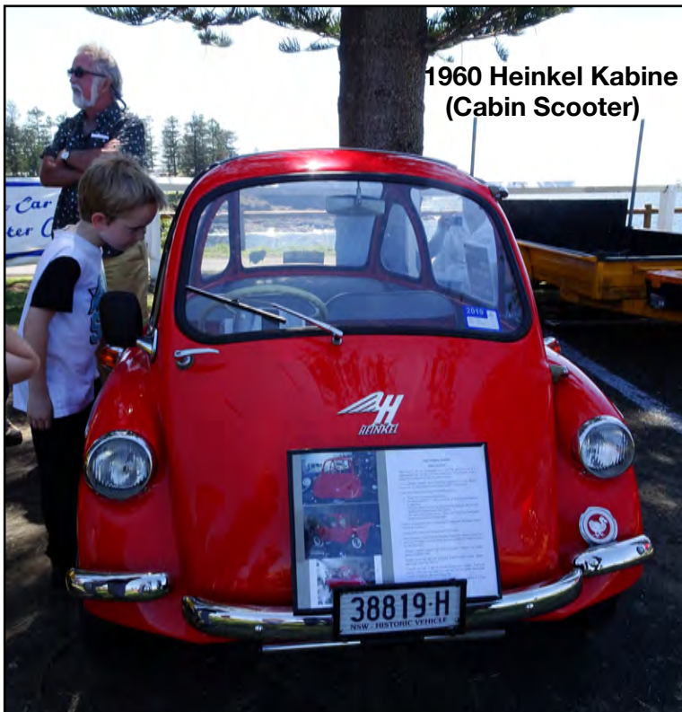
1960 Heinkel Kabine (Cabin Scooter)