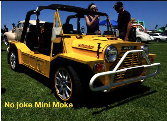
No joke Mini Moke