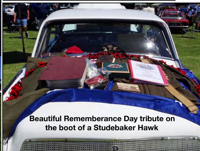
Beautiful Remembrance Day tribute on the boot of a Studebaker Hawk