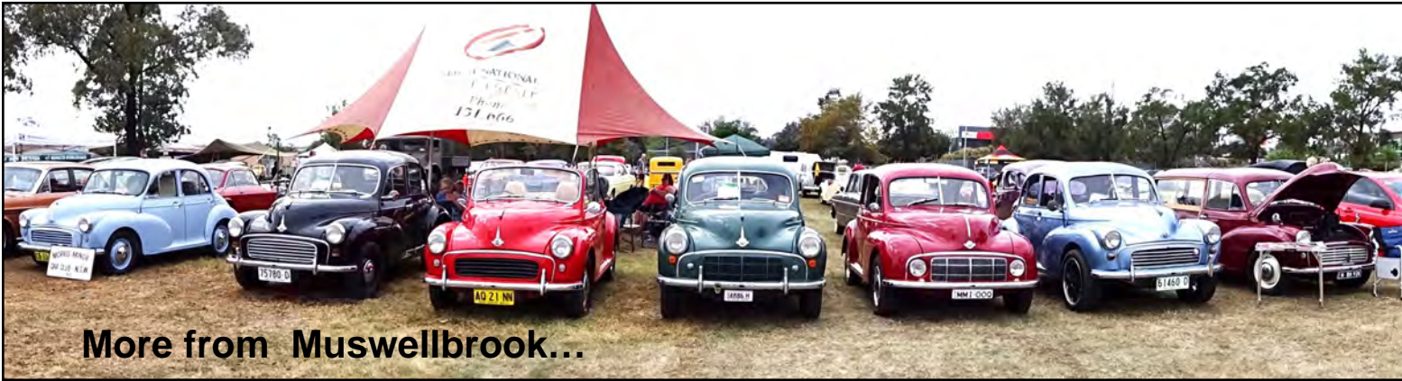
More from Muswellbrook...