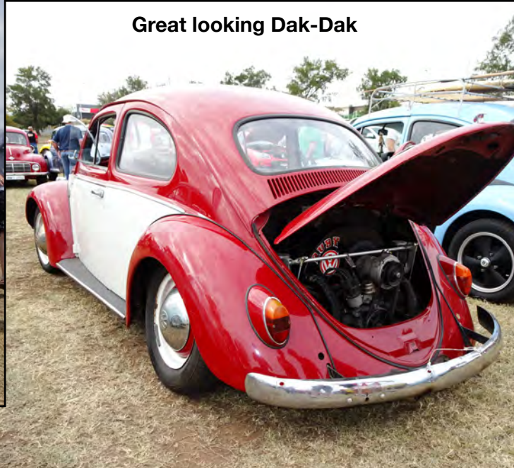
Great looking Dak-Dak