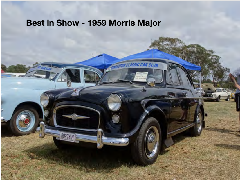
Best in Show - 1959 Morris Major