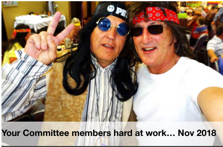
Your Committee members hard at work... Nov 2018