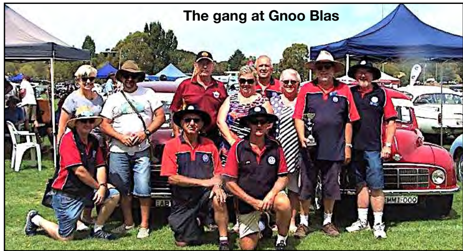
The gang at Gnoo Blas