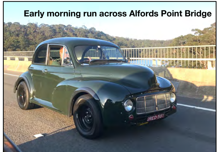
Early morning run across Alfords Point Bridge

Then came the black car, purchased in 2011 from Ray Selby. The gold car was Jim's most recent acquisition - and Jye Sommers, Jim's neighbour, really enjoys driving it.