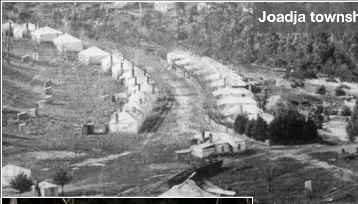
Joadja township - then and now