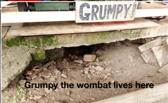
Grumpy the wombat lives here