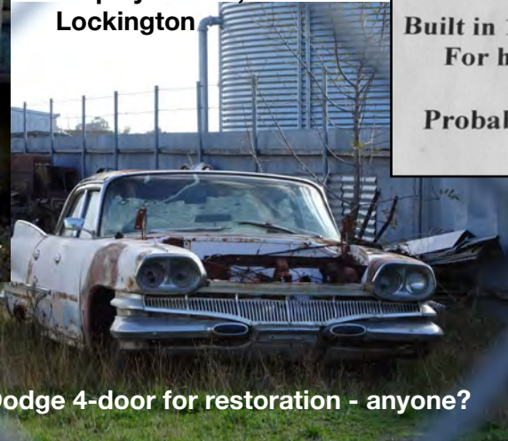
1960 Dodge 4-door for restoration - anyone?