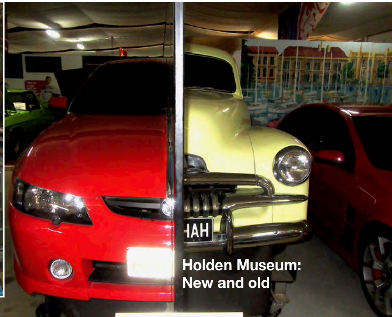
Holden Museum: New and old