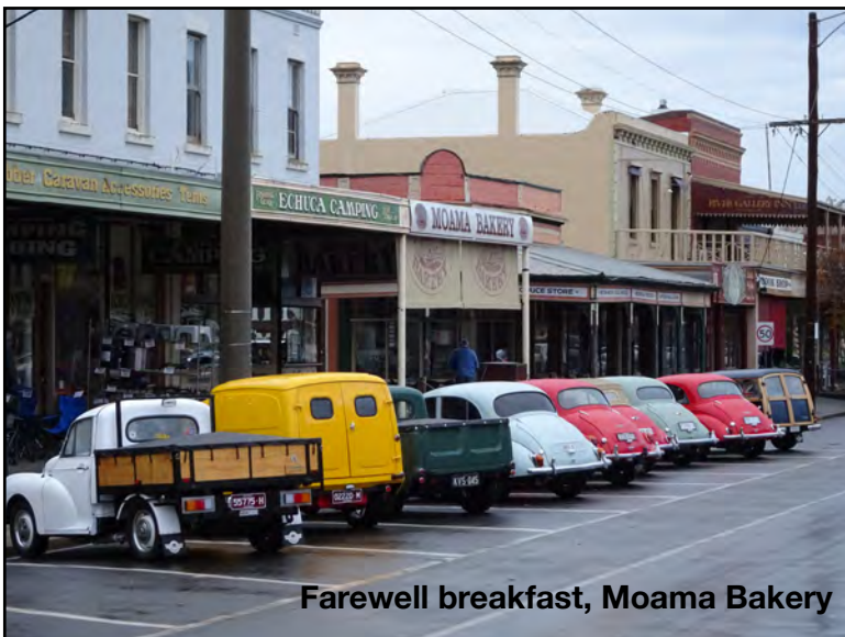
Farewell breakfast, Moama Bakery

On Monday morning we were supposed to have bacon and egg rolls with tea and coffee at a local park. The weather forecast for Monday morning wasn't great so I negotiated a deal with the local bakery for everyone to receive their entry fee back in food from the bakery. It couldn't have worked out better! Everyone had $10 each to spend at the bakery. Most stayed there for quite a while so I dare say everyone was enjoying the food and the atmosphere. This is where we all said goodbye and set off back home.