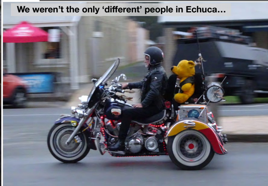
We weren't the only 'different' people in Echuca...