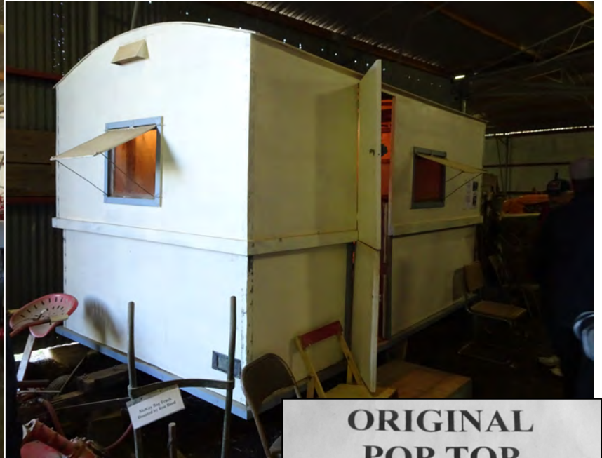
Some artefacts from the Farm Machinery Display Centre, Lockington