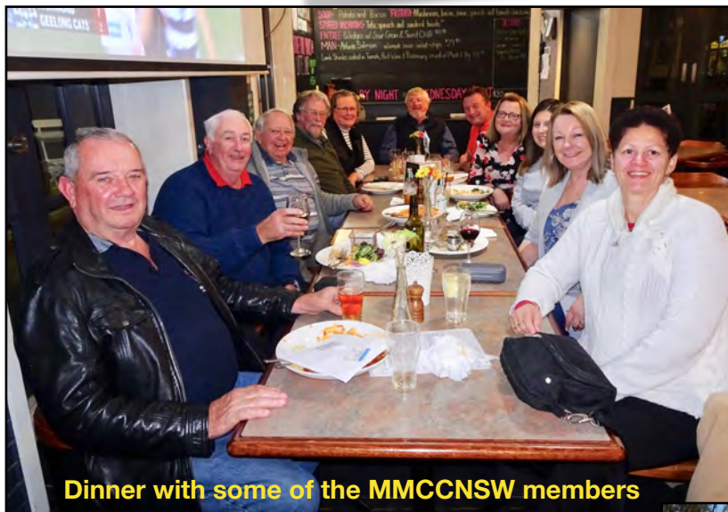
Dinner with some of the MMCCNSW members

It all started around 9.30 on the Saturday morning. Our cars were all in place by around 9.45 and soon there were people everywhere looking at our display. We even had a Minor Junior on display! I had never seen one finished until the Echuca trip (I did see them at