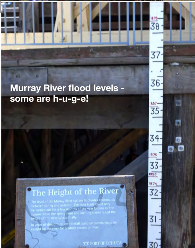
Murray River flood levels - some are h-u-g-e!