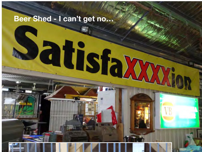
Beer Shed - I can't get no...