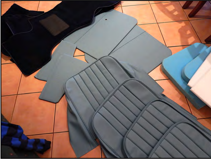
New trim for John's ute. Is that the family room floor?

gauge was showing warmer than normal and a small green water leak near a head stud was seen, I removed the head. This was despite the fact a compression test was OK. Results were all good - no blown head gasket at all, it was a leak was from a thermostat I had fitted and the gasket was leaking. I also found the temperature gauge is faulty; still, a good time for a de-coke, re-paint and clean up. I was impressed how clean inside the head was from the Penrite oil I use.