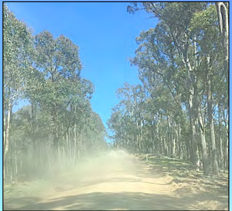
The many landscapes on esCarpade