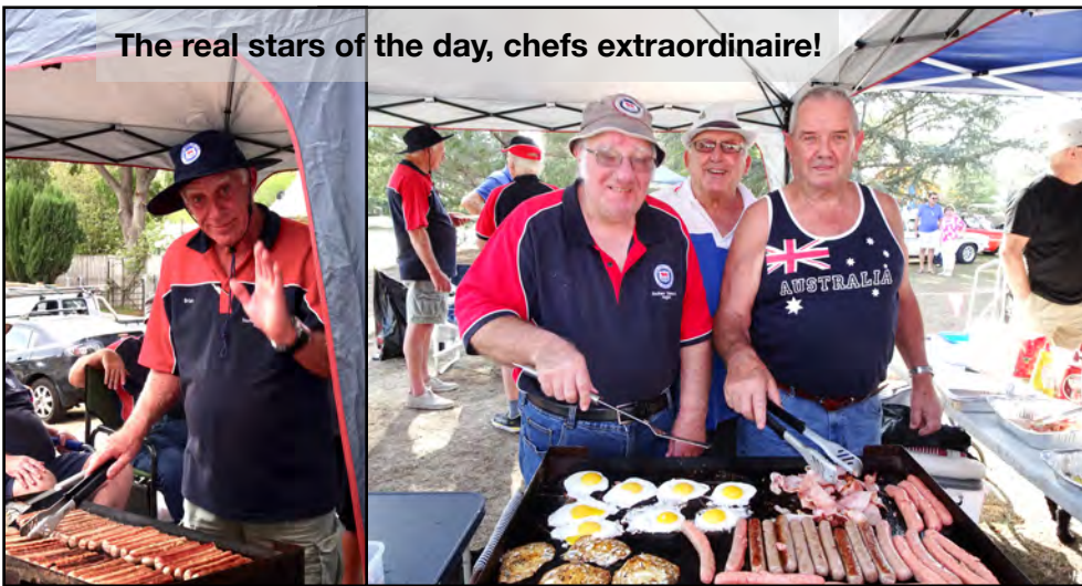
The real stars of the day, chefs extraordinaire!