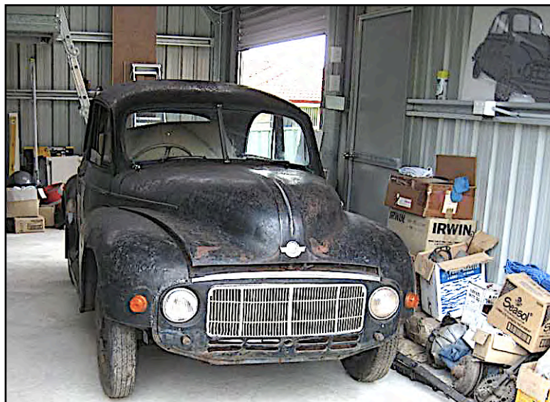
Blackie ready & waiting for its restoration in Ulladulla

The good news is that “Blackie’s” restoration has now been underway since 2018 with completion hoped for in 2021 – but that’s another story . . .