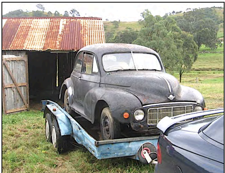
Arriving at the hay shed in Hilldale