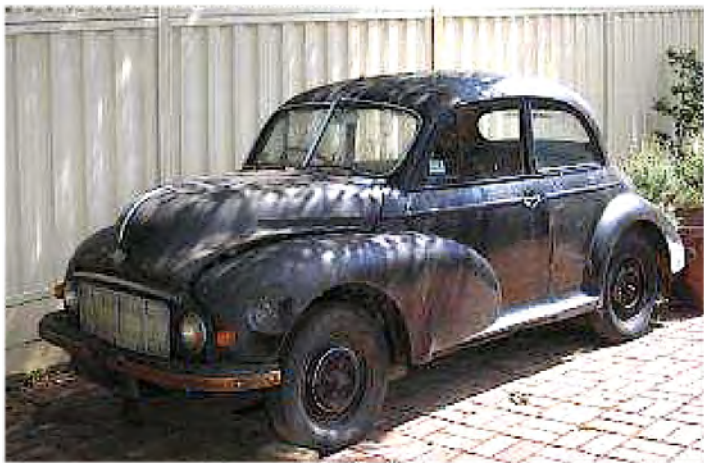
As first seen, sitting in Montmorency, Melbourne