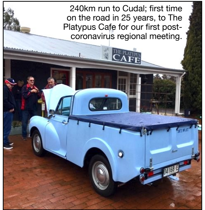
240km run to Cudal; first time on the road in 25 years, to The Platypus Cafe for our first post-coronavirus regional meeting.