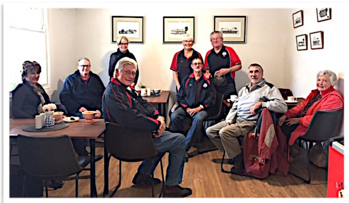
Central West Region members enjoy their coronavirus breakout get-together at The Platypus Cafe, Cudal