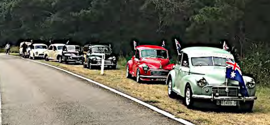
Above: ready for the 'parade'