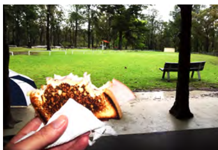
One person's idea of a 'BBQ lunch' - the minimalist approach