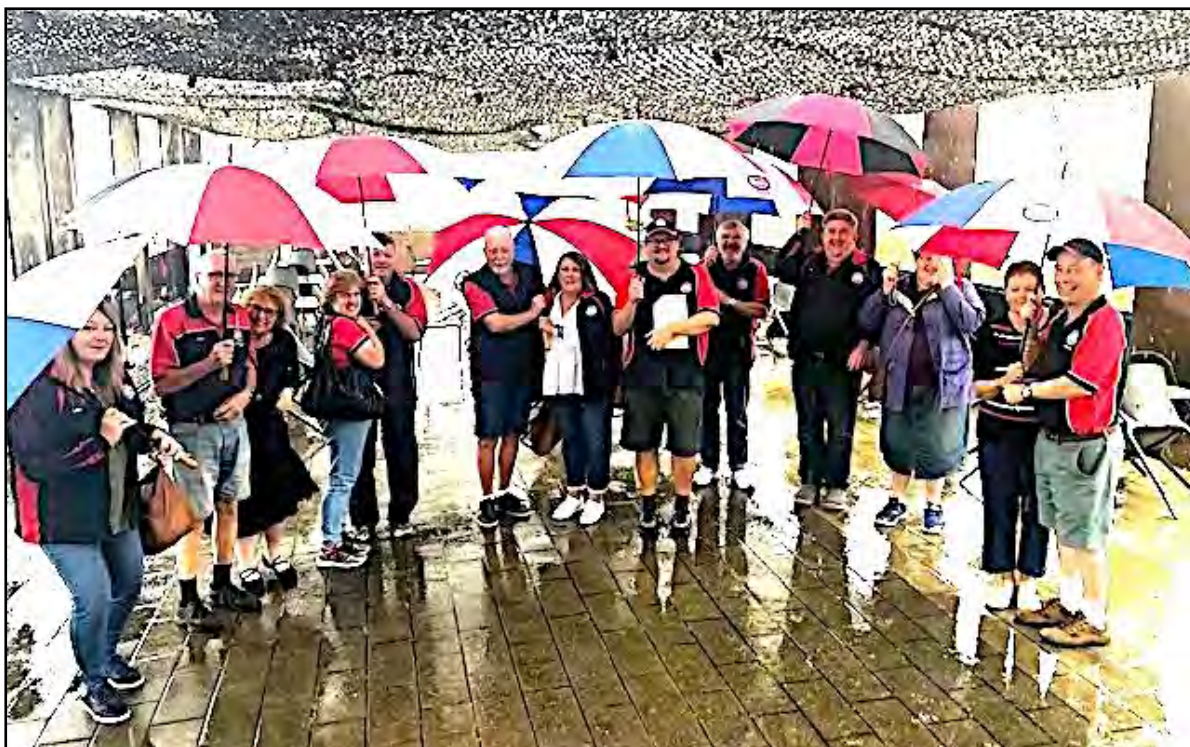
The start of eastern Australia's 'big wet'. Love the Morris Minor umbrellas!