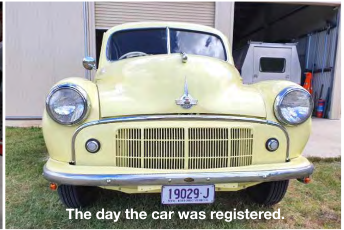
The day the car was registered.