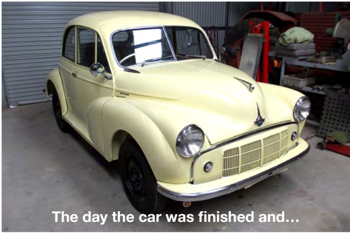
The day the car was finished and...