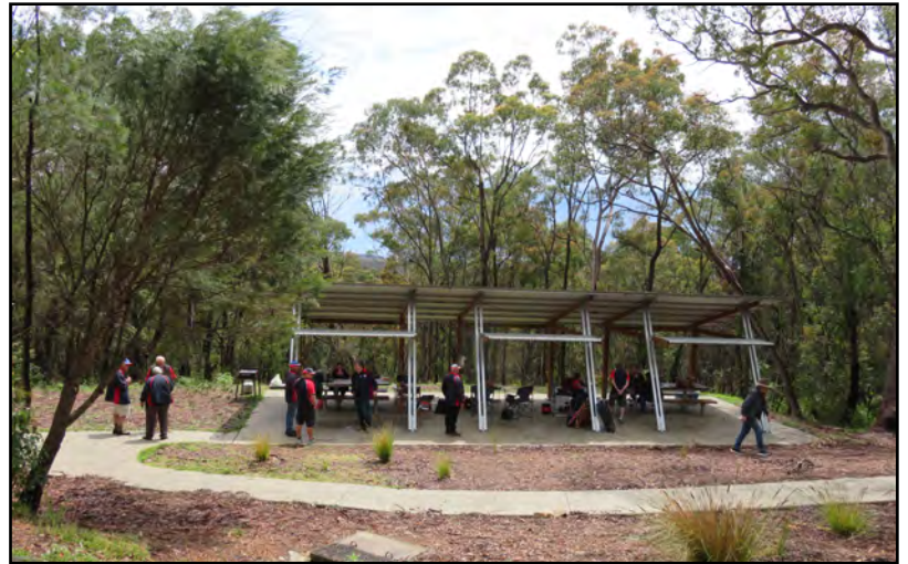
The weather started out quite fine. There was even some blue sky to be seen.

Well in the end I risked it, along with 16 other members with their 8 Morries and several moderns. It was a picturesque run out through the semi-rural countryside after leaving Camden, through the pretty village