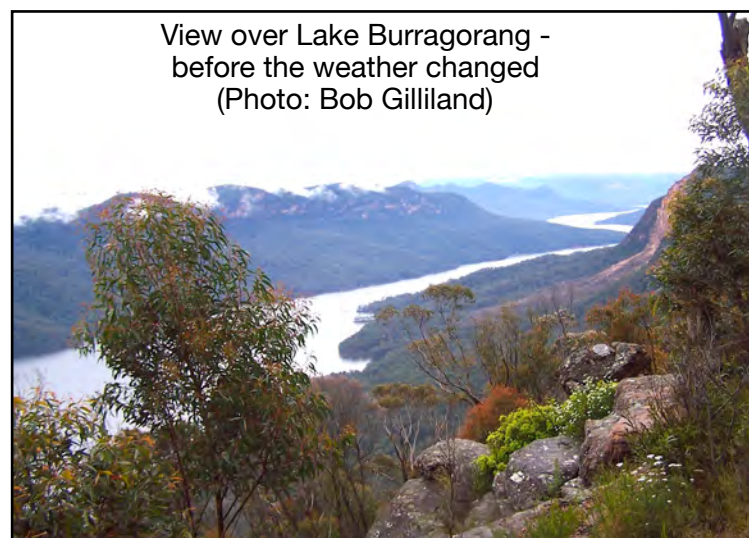
View over Lake Burraborang - before the weather changed