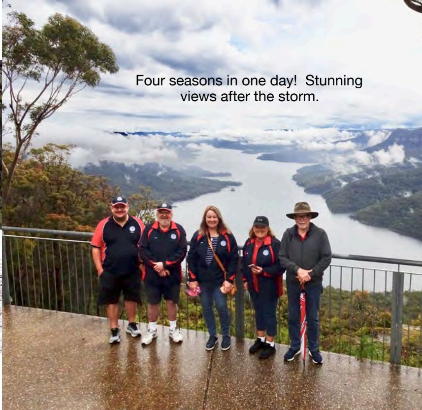
Four seasons in one day! Stunning views after the storm.

After the storms had passed, some left for home, while others of us went to the lookout to check on the changing conditions over Lake Burragarang – and were rewarded with some wonderful views. Then it was retracing our steps on our homeward run. Both 'Bluey' and I enjoyed our day out immensely.