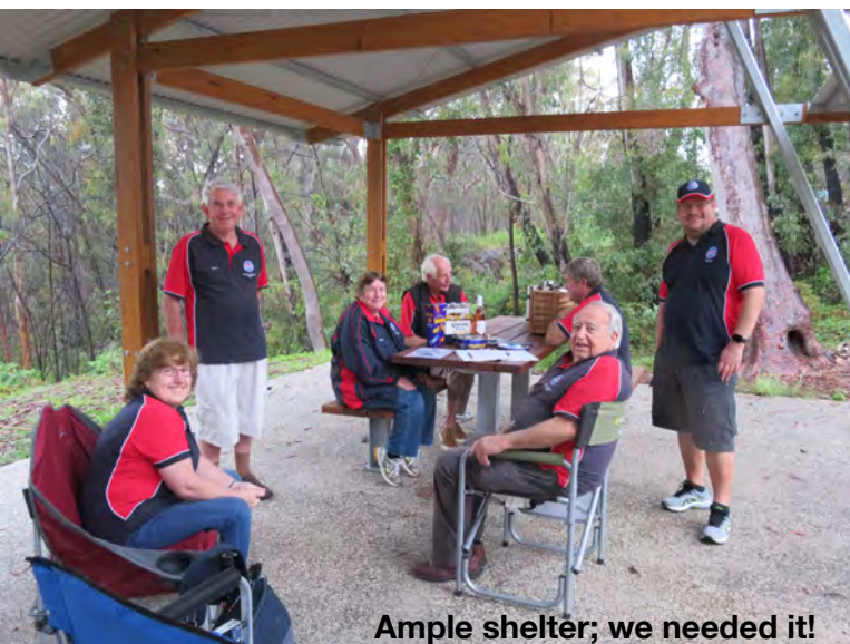
Ample shelter; we needed it!

Despite the changing weather conditions throughout the day, it turned out to be a great outing, enabling us to catch up after about 5 months of lockdown with