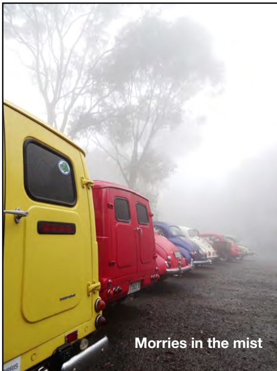
Morries in the mist

“Wow”, I thought. “Do we go ahead with this? The weather forecast is not good. Should I go and subject my beloved Morrie to the potential storms that had been predicted? But this is the first Club event for 5 months, so I’m sure my car wants to go, even if I’m hesitant.”