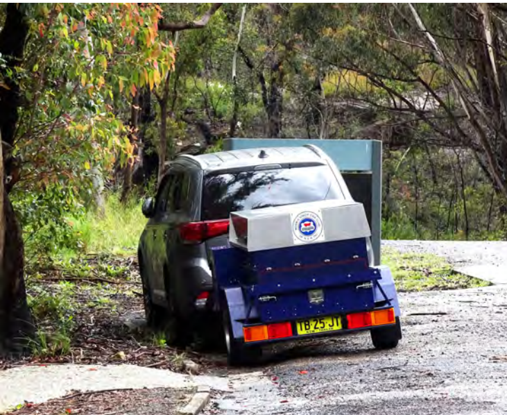
The gold standard of great organisation: David Bursill towed the club trailer/BBQ to a place where BBQs are provided - but didn't work!