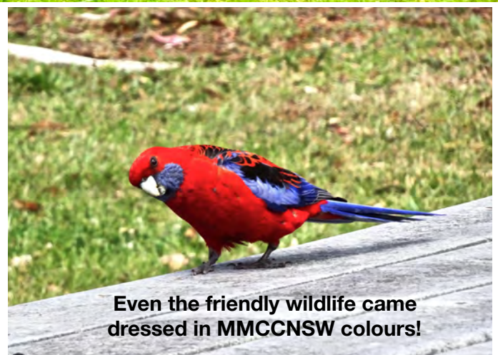
Even the friendly wildlife came dressed in MMCCNSW colours!

It wasn't perfect, mind you. A few participants confused Cataract Dam with Cordeaux Dam, a completely understandable mistake, but normal transmission was restored and we all ended