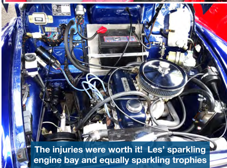
The injuries were worth it! Les' sparkling engine bay and equally sparkling trophies

who had the numerous scratches and multiple bruises to show for his commitment to an ultra-clean engine bay. It was worth the effort as the extra points scored under the bonnet resulted in Les winning not only Best Modified but also Best In Show.