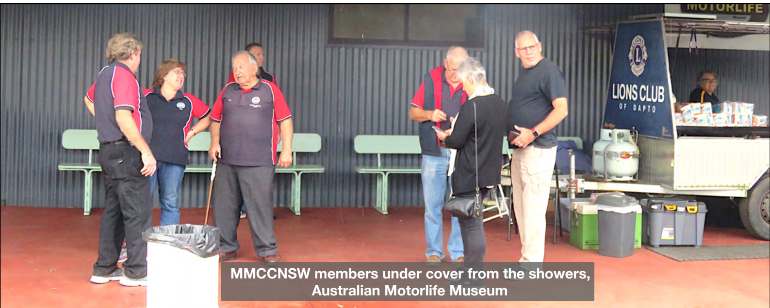
MMCCNSW members under cover from the showers, Australian Motorlife Museum