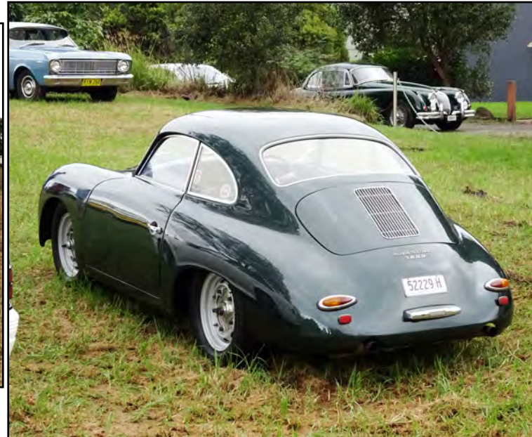
OMG, a Porsche 356, predecessor to the 911 - WHAT A CLASSIC !!!