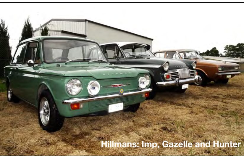
Hillmans: Imp, Gazelle and Hunter