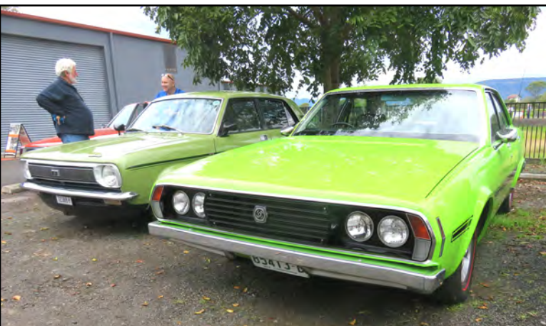
Quite a few P 76s, and one immaculate Marina - with a Rover engine of course