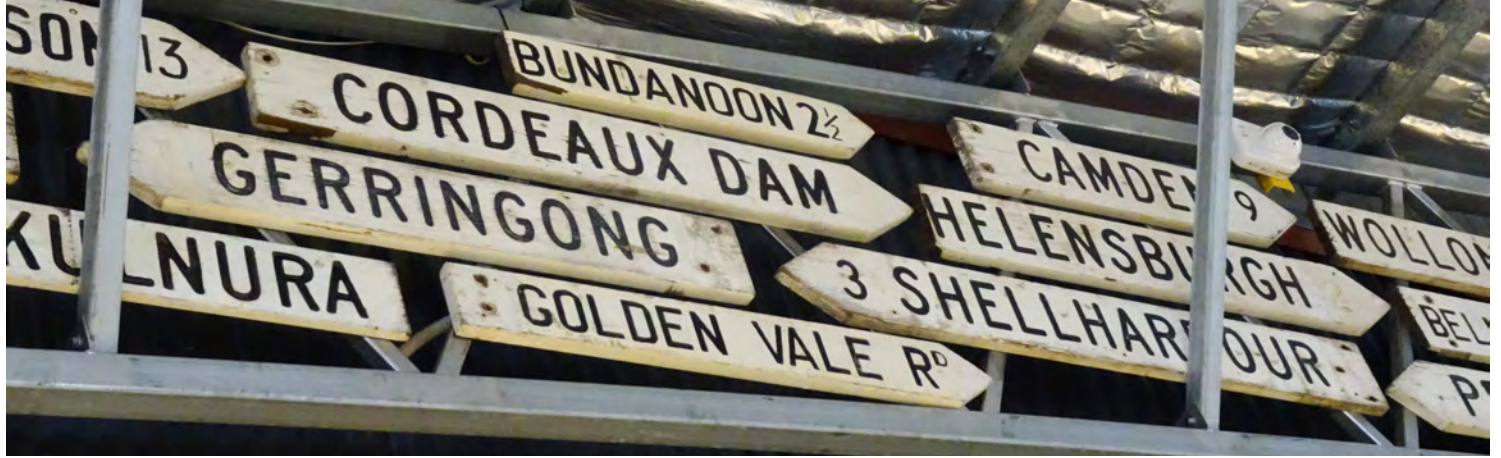
Above: "I've been everywhere, man..."