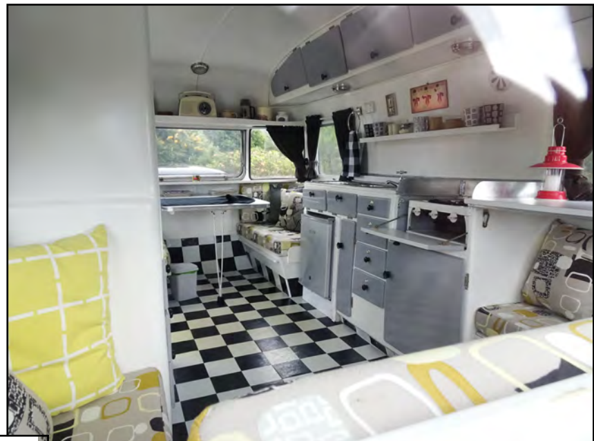
One for the caravan brigade: immaculate 1962 XL Falcon towing equally-immaculate caravan - with all the 1960s extras!