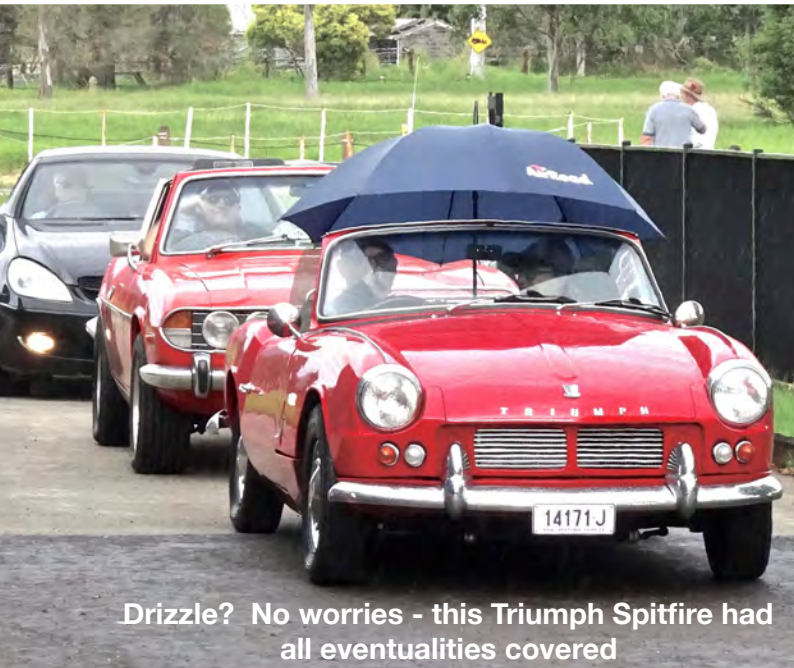
Drizzle? No worries - this Triumph Spitfire had all eventualities covered