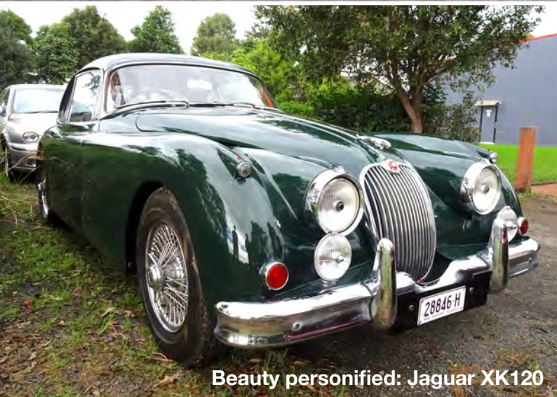
Beauty personified: Jaguar XK120