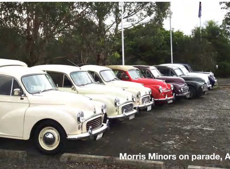
Morris Minors on parade, Australian Motorlife Museum