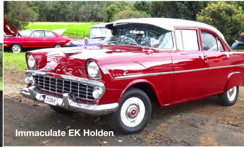
Immaculate EK Holden