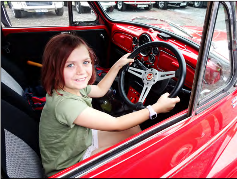
A minor in a Minor! It's a small world: the same girl who loved the 'little red car' at Berry in 2021 (see Minor Torque May-June 2021) was there again in 2022. Parents, you're doing it right :)