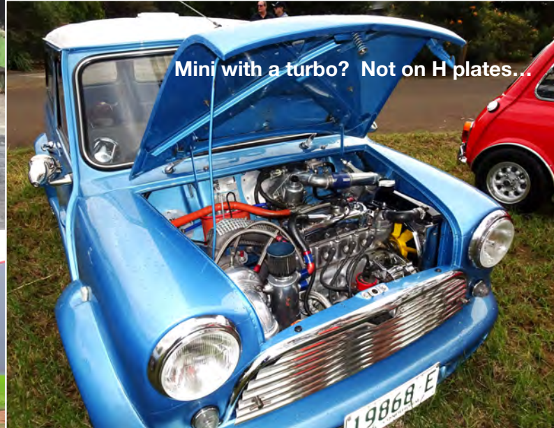
Mini with a turbo? Not on H plates...