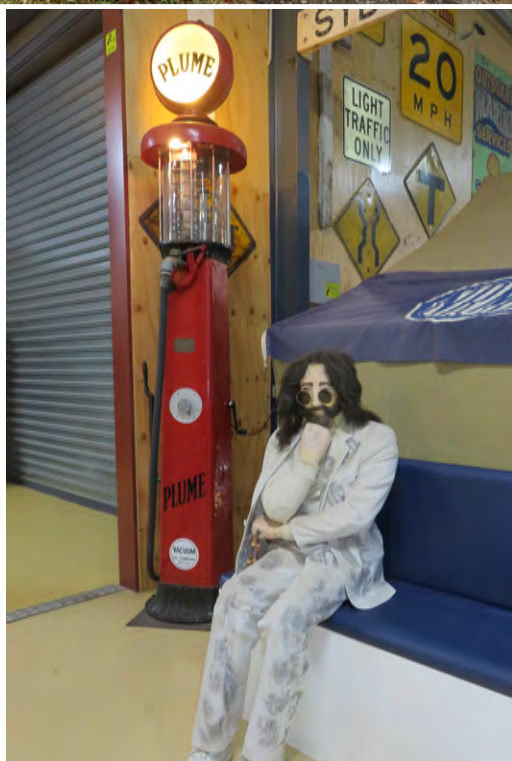
Time to ponder...