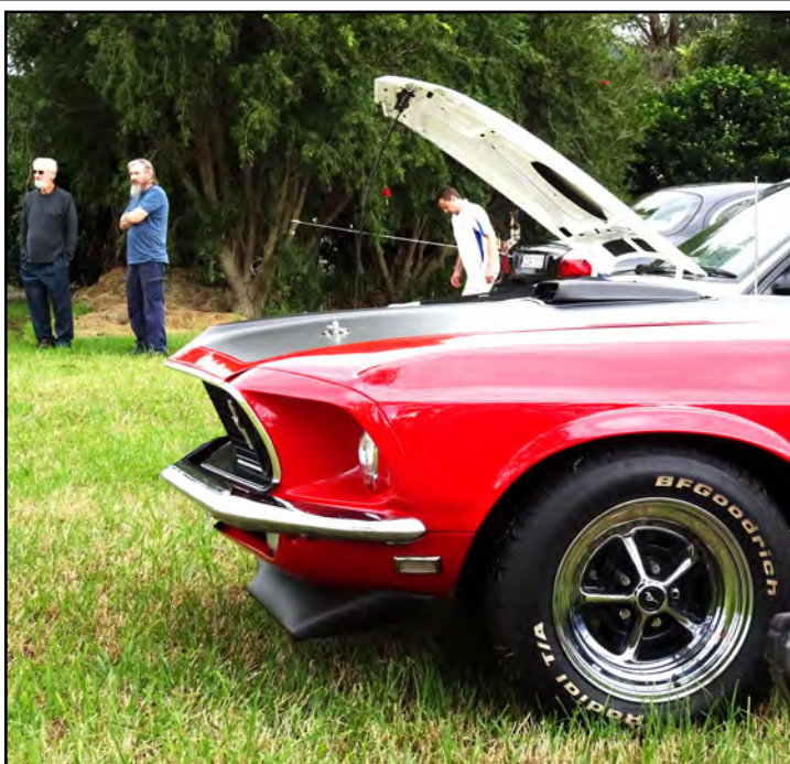
The unmistakable snout of an early 1970s Boss Mustang