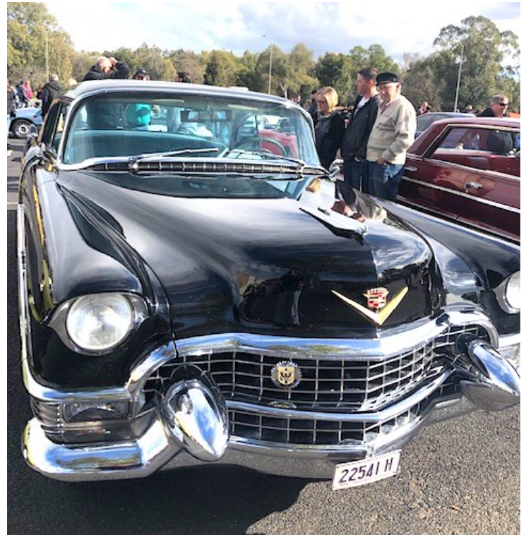
Some classics at Cars & Coffee

I have finally got back to Cars & Coffee, which has moved a few times to a wet weather venue (the shopping mall car park). Council won't let the cars ruin the grass and driveway at the Cenotaph. Beside the fact I was on my own I did have some pleasing comments about the Ute and a couple of offers to buy. I also made the September Fathers Day show and run on Sunday with both vehicles