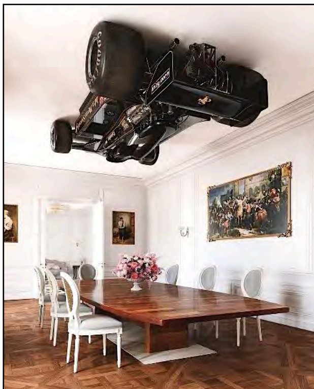
Having difficulty starting up a conversation with dinner guests? Try a Lotus 78 on the ceiling...