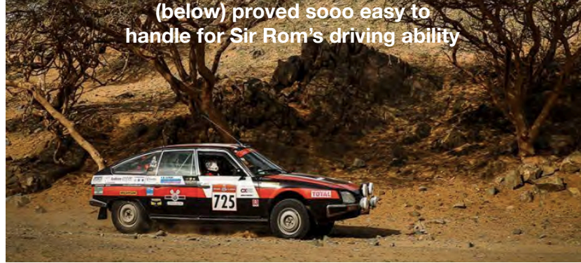
Dac dac (above) and Citroen (below) proved sooo easy to handle for Sir Rom's driving ability