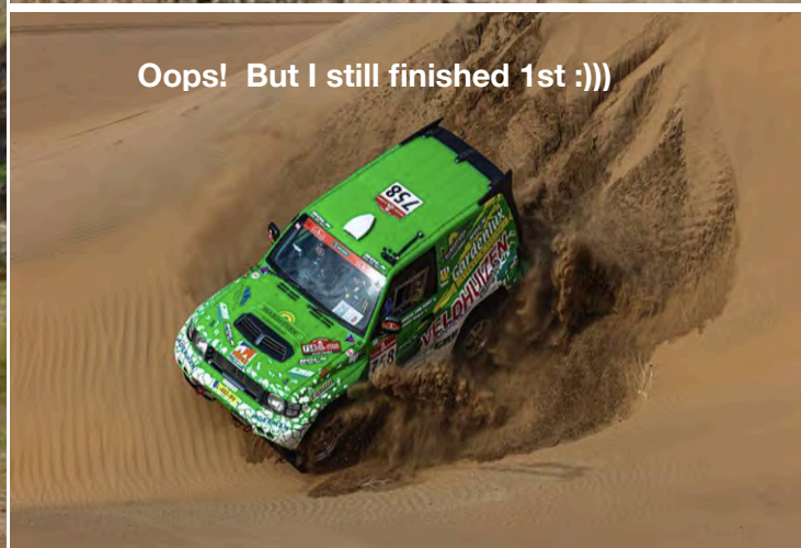
Oops! But I still finished 1st :)))