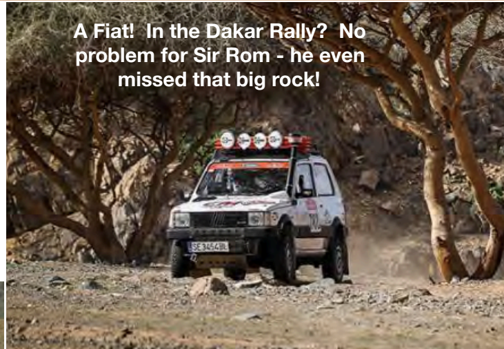
A Fiat! In the Dakar Rally? No problem for Sir Rom - he even missed that big rock!