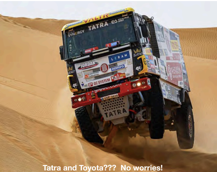
Tatra and Toyota??? No worries!