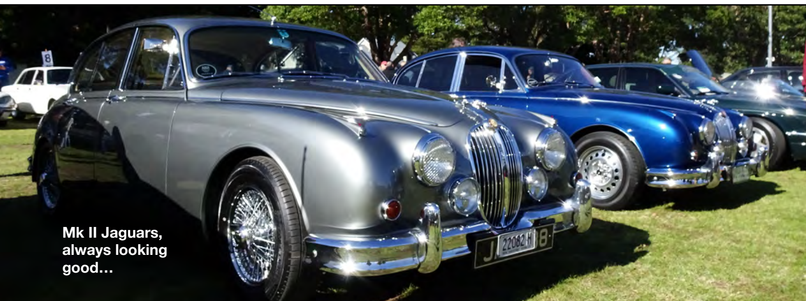
Mk II Jaguars, always looking good...