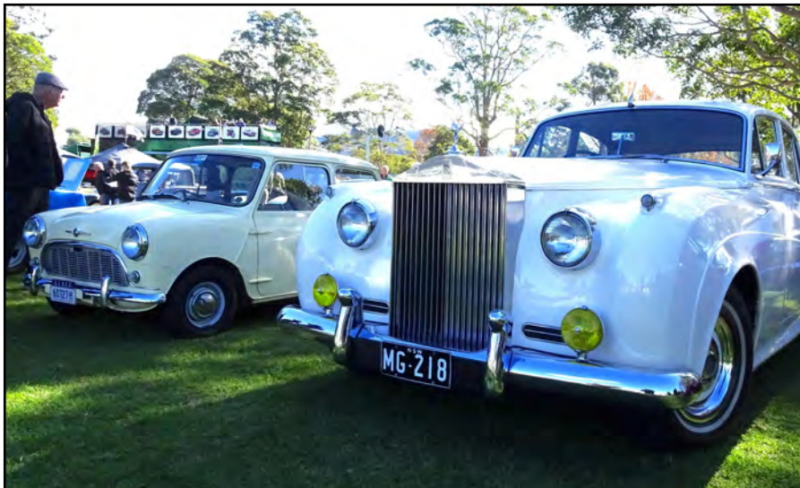
The best of British, large and small