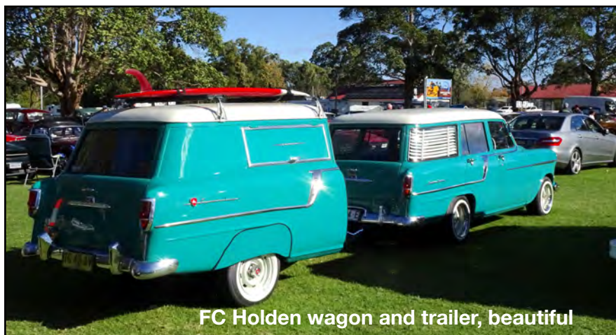
FC Holden wagon and trailer, beautiful