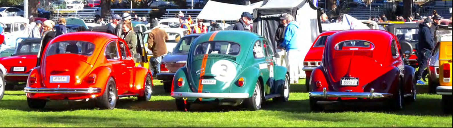
(Above) VWs looked, and sounded, and drove, superbly, while Triumph TR6s (below) look fast even when standing still