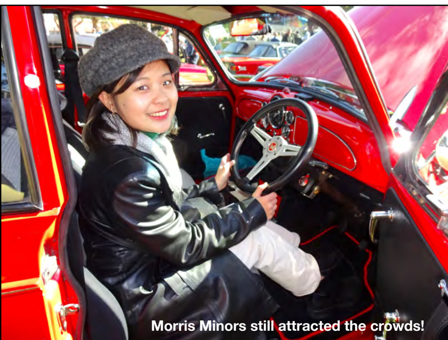
Morris Minors still attracted the crowds!