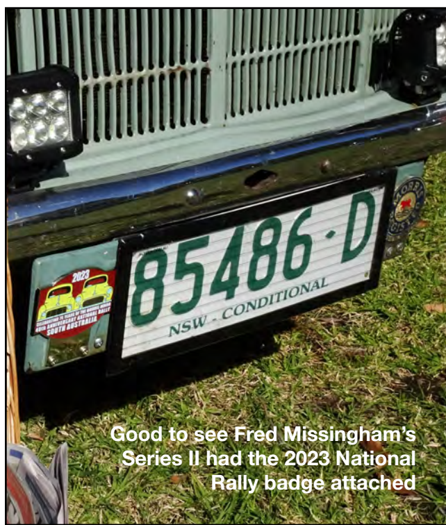
Good to see Fred Missingham's Series II had the 2023 National Rally badge attached