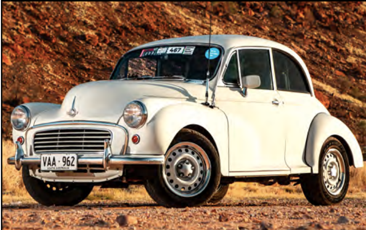
1S-POWERED 1962 MORRIS MINOR 1000 SLEEPER

https://www.whichcar.com.au/features/graham-coles-1s-1962-morris-minor-1000-sleeper?