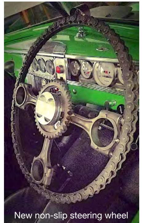
New non-slip steering wheel