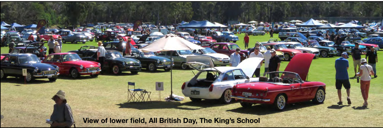
View of lower field, All British Day, The King's School