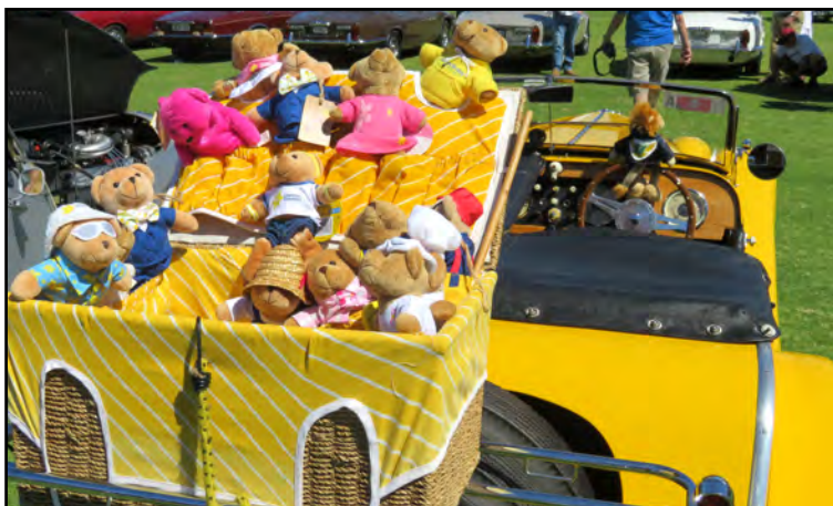
Bears bears bears!