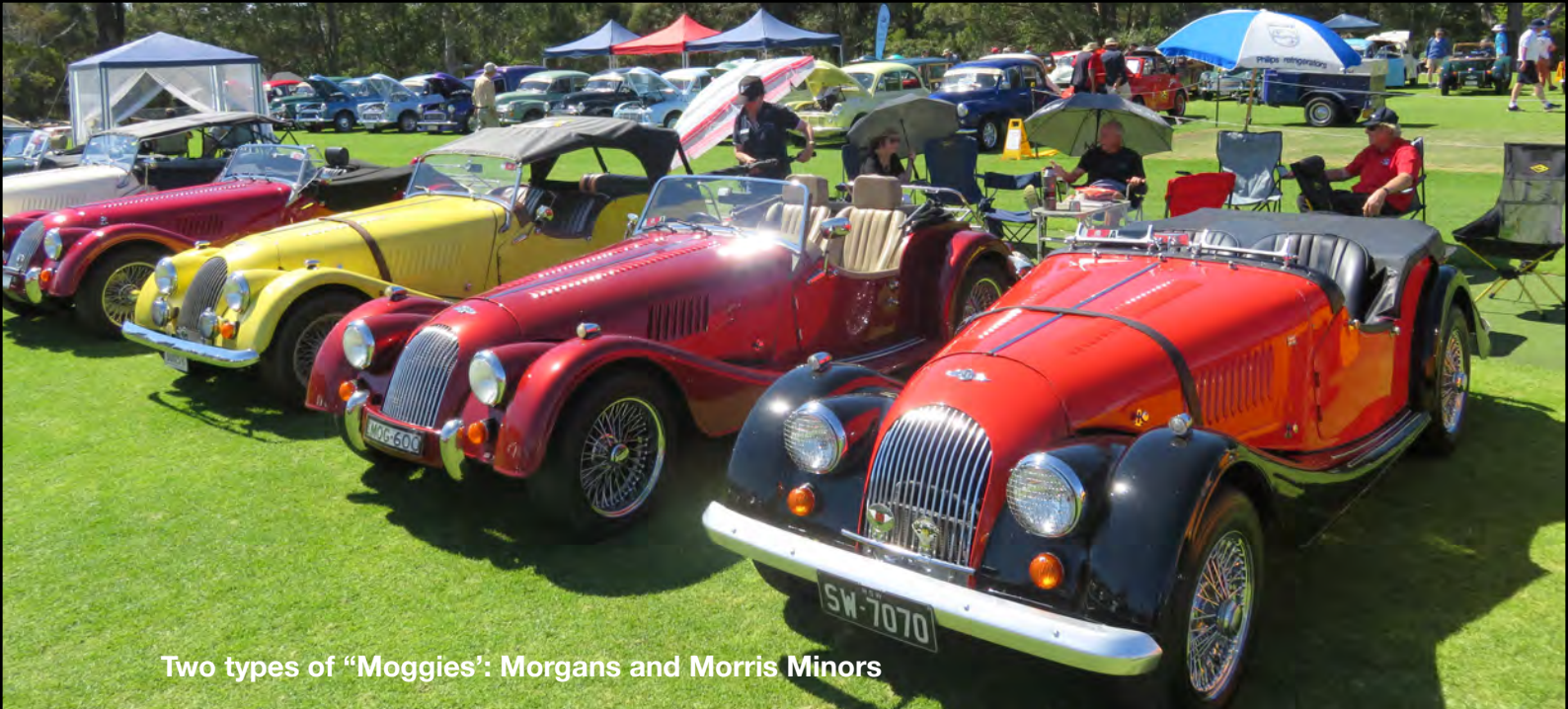
Two types of "Moggies": Morgans and Morris Minors