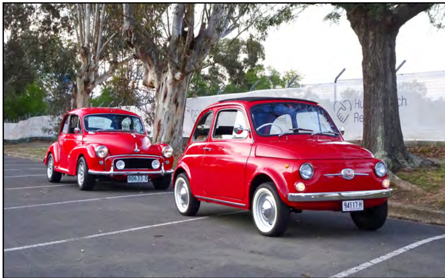
I was pulled over on the way home from work one day. The guy driving the Fiat had recently put it back on the road after a rebuild and just wanted to chat. Introduced in 1957, the 500 (aka Bambino) in t-i-n-y. My Morris Minor looked huge in comparison.

How do replace a chassis rail in a Morrie when you don't have a hoist? Simple, according to George Antonijevic: just run the left side up on ramps and lift/push the car onto a mattress using an engine crane! Be careful not to reverse the sides, petrol has a way of finding its way out of the fuel filler cap.