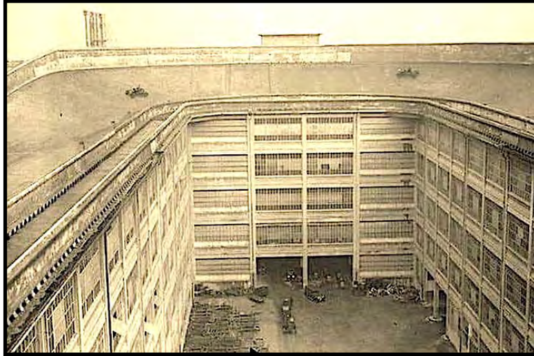
The Fiat factory in Turin, finished in 1923, had a 1.5km rooftop test track. The same track was used in the classic movie 'The Italian Job'.